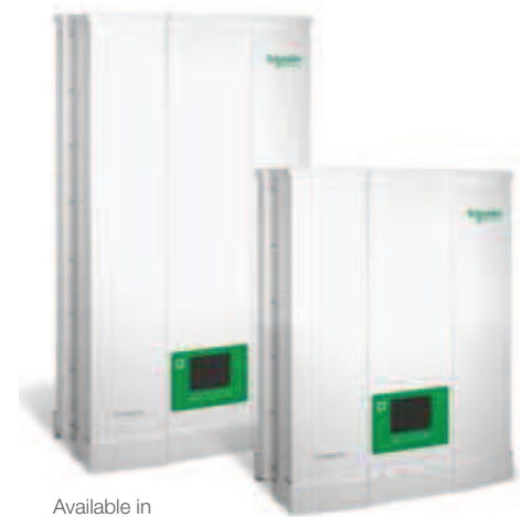
Available in 15 and 20 kW